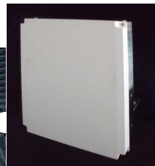
User equipment (16 antennas)