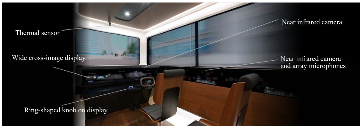
Rendition of EMIRAI S

TOKYO, October 8, 2019 – Mitsubishi Electric Corporation (TOKYO: 6503) today unveiled its EMIRAI S concept car equipped with cutting-edge technologies, such as an innovative human-machine interface and biological-sensing technologies, which are expected to contribute to safe and secure transportation as well as enhanced passenger communication in the upcoming mobility-as-a-service (MaaS) society. The EMIRAI S will be exhibited during 46th Tokyo Motor Show 2019 at the Tokyo Big Sight exhibition complex from October 24 to November 4.