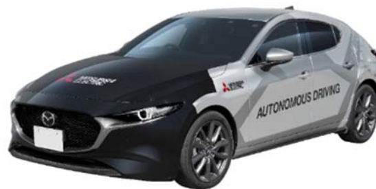
Mitsubishi Electric xAUTO autonomous-driving demonstration vehicle

TOKYO, October 21, 2019 – Mitsubishi Electric Corporation (TOKYO: 6503) announced today that it would exhibit the latest version of the xAUTO, a vehicle capable of autonomous driving on surface roads without high-definition maps and autonomous parking both indoors and outdoors, during the 46th Tokyo Motor Show 2019 at the Tokyo Big Sight exhibition complex from October 24 to November 4. The xAUTO is a demonstration car that incorporates Mitsubishi Electric's cutting-edge technologies for autonomous driving.