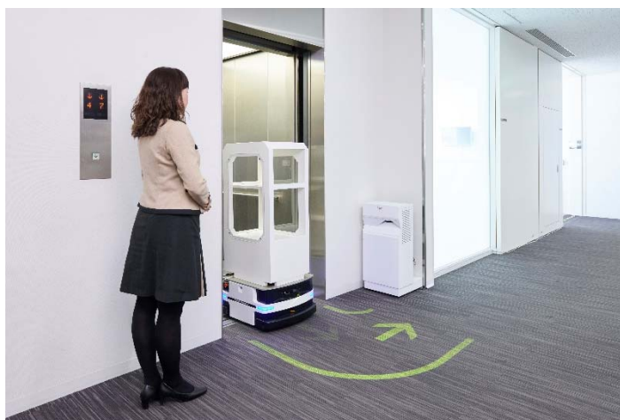
Animated lighting indicates movements of In-Building Mobility

** Buildings in which advanced IoT is deployed to energy-saving and labor-saving work environments through the building