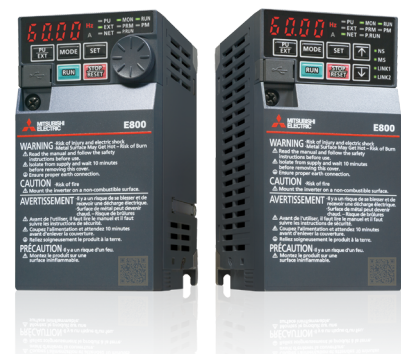
The FR-E800 from Mitsubishi Electric gives the operator more control over speed.